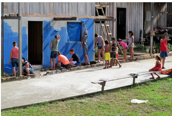
This is one of the two homes we painted in the village. The homes were chosen via a lottery before we came.

consisted of painting two houses and updating the church there. It didn't seem like