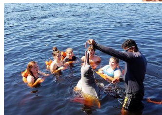
Swimming with the dolphins on our excursion day. We weren't allowed to touch them, but they could move about as will so they would swim between our legs, or run into us as they were swimming by.