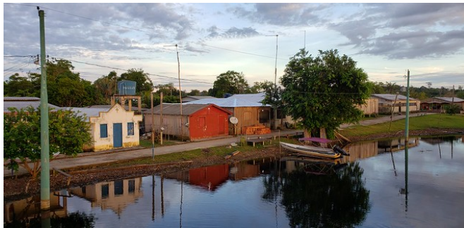
This is the small village where we worked. Some of the homes were on stilts over the water, as was the Adventist Church.

At the village we docked at, our purpose was to connect with the community members by providing