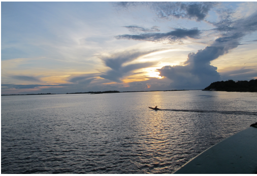
Sunset on the Amazon River our first night out on the boat.

but it was all we needed to do our mission work. The covered part of the deck held all of our hammocks and luggage, but there was