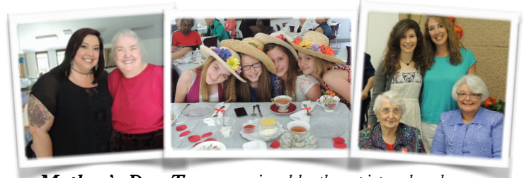
Mother's Day Tea was enjoyed by those pictured and many others. Thanks to the workers who made it a special day for all!