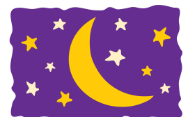
New Year's Eve Communion Service

Plans are being made for an Agape Feast and Candlelight Communion Service on New Year’s Eve at Toledo First. You are invited. What better way to welcome a brand new year? ##